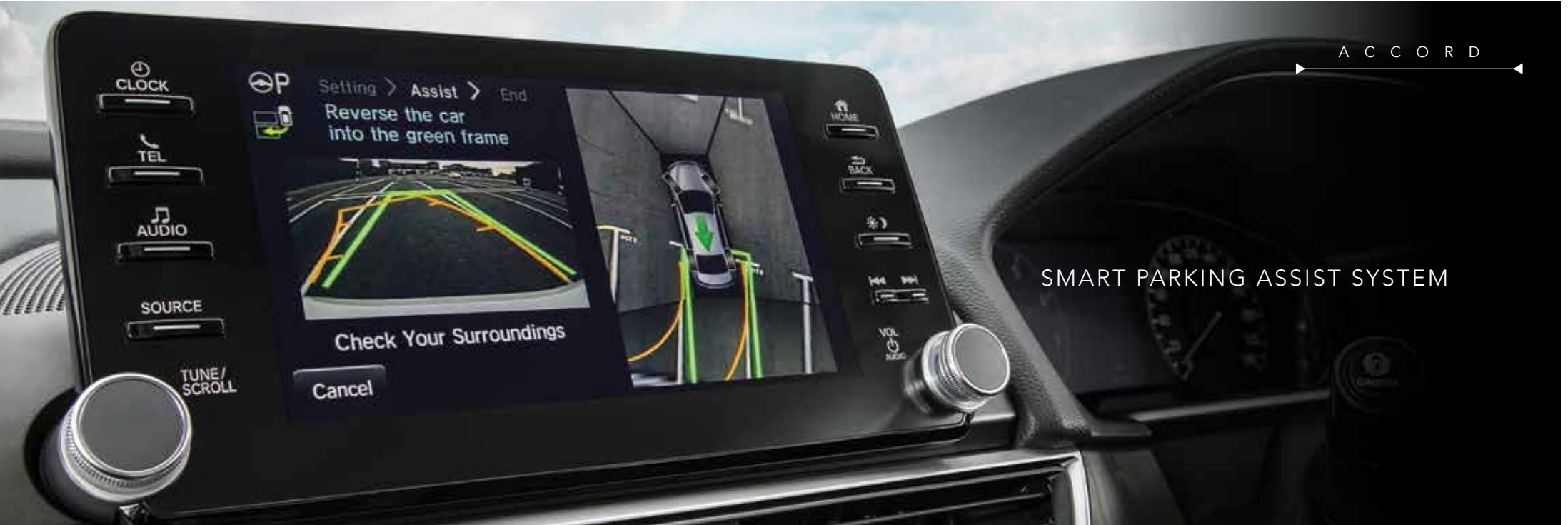
SMART PARKING ASSIST SYSTEM